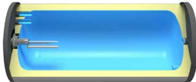
Side Section View